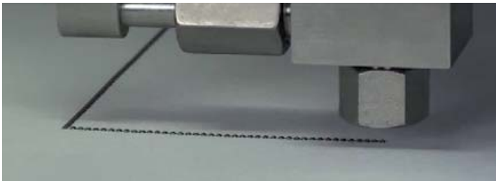
Liquidyn Jet Dispenser