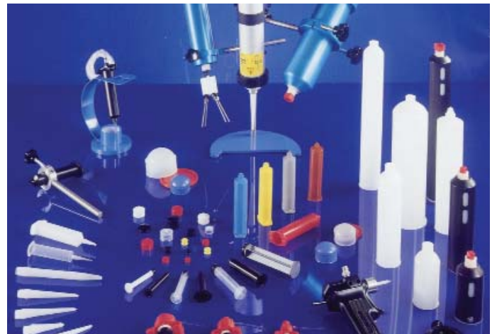
And we also have the suitable accessories.

You can find further information about our product groups in our special product data sheets. For our comprehensive range of accessories for each product series, please ask for our detailed information sheets.